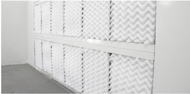
Exhaust filters on wall

Where intake filters ensure that you are working with clean air from the start, exhaust filters make sure the air leaving your paint booth is safe for the environment, while also keeping potentially dangerous chemicals from remaining in the airflow of the booth. Exhaust filters capture solid and liquid aerosols that painters can be exposed to through inhalation or dermal adsorption. The filters also keep those highly toxic materials from being released into the environment after passing through the booth.