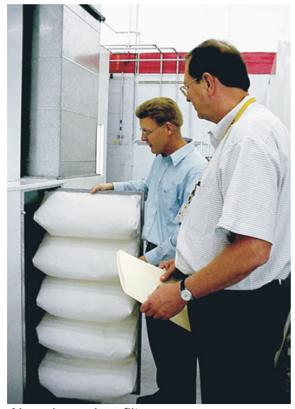
Air make-up bag filter

Depending on your paint booth setup, your first line of filtration defense may be air make-up filters.