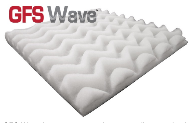
GFS Wave is a nonwoven polyester media comprised of coarse and fine, standard and low-melt fibers

GFS Wave filters are extremely versatile single-stage filtration media for use as exhaust filters. They are included in all GFS paint booths, accommodating all paints and a wide array of spray applications, from clear coats to high solids. The patented wave pattern of the filter provides 2.3 times more surface area for every square foot of face area in an existing frame system.