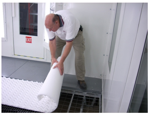
Exhaust roll media for pit

Most paint booths typically use single-stage filters. The type of exhaust filter used is the same for crossdraft and downdraft booths, but the location and frame configuration differ. In crossdraft booths, there are plenum or wall filters, whereas in downdraft booths, exhaust pit filters are used.